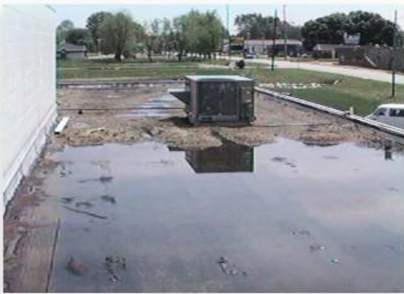
Showing a neglected roof that had to be completely replaced.

Our main focus is to work with our clients, showing them and educating them in the proper methods, techniques and the resulting benefits of regularly managing & maintaining their facility roofing assets . Only as a last resort will we recommend a completely new roofing system. Whether your existing roofing system is new, five years old or near exhaustion, we will help you get the most out of your investment.